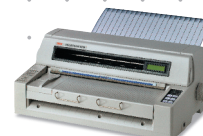
Dot Matrix Printers